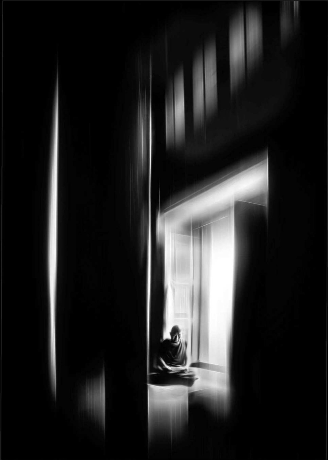
Shunyata: The Ultimate Void: Zanskar