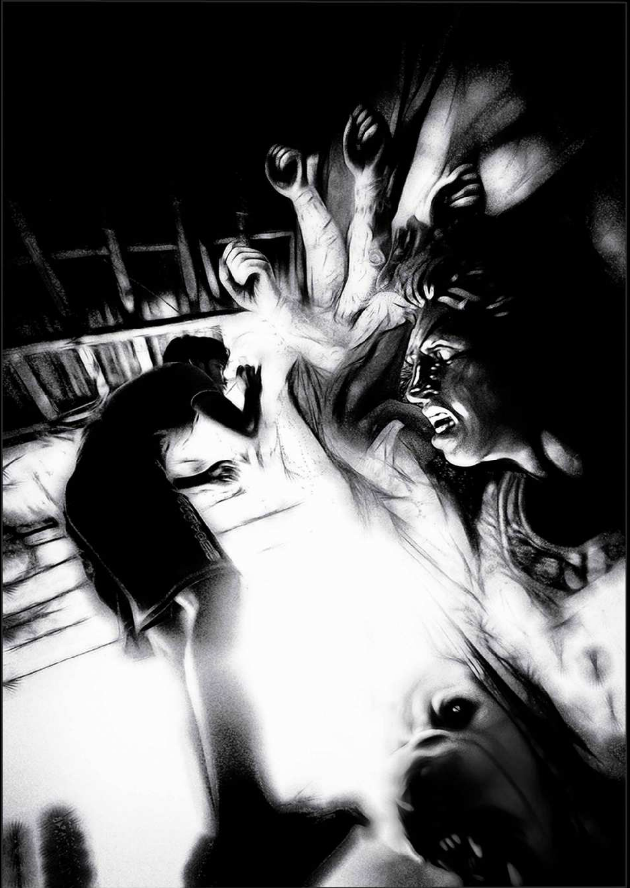
Kali: Durga Puja: Kolkata