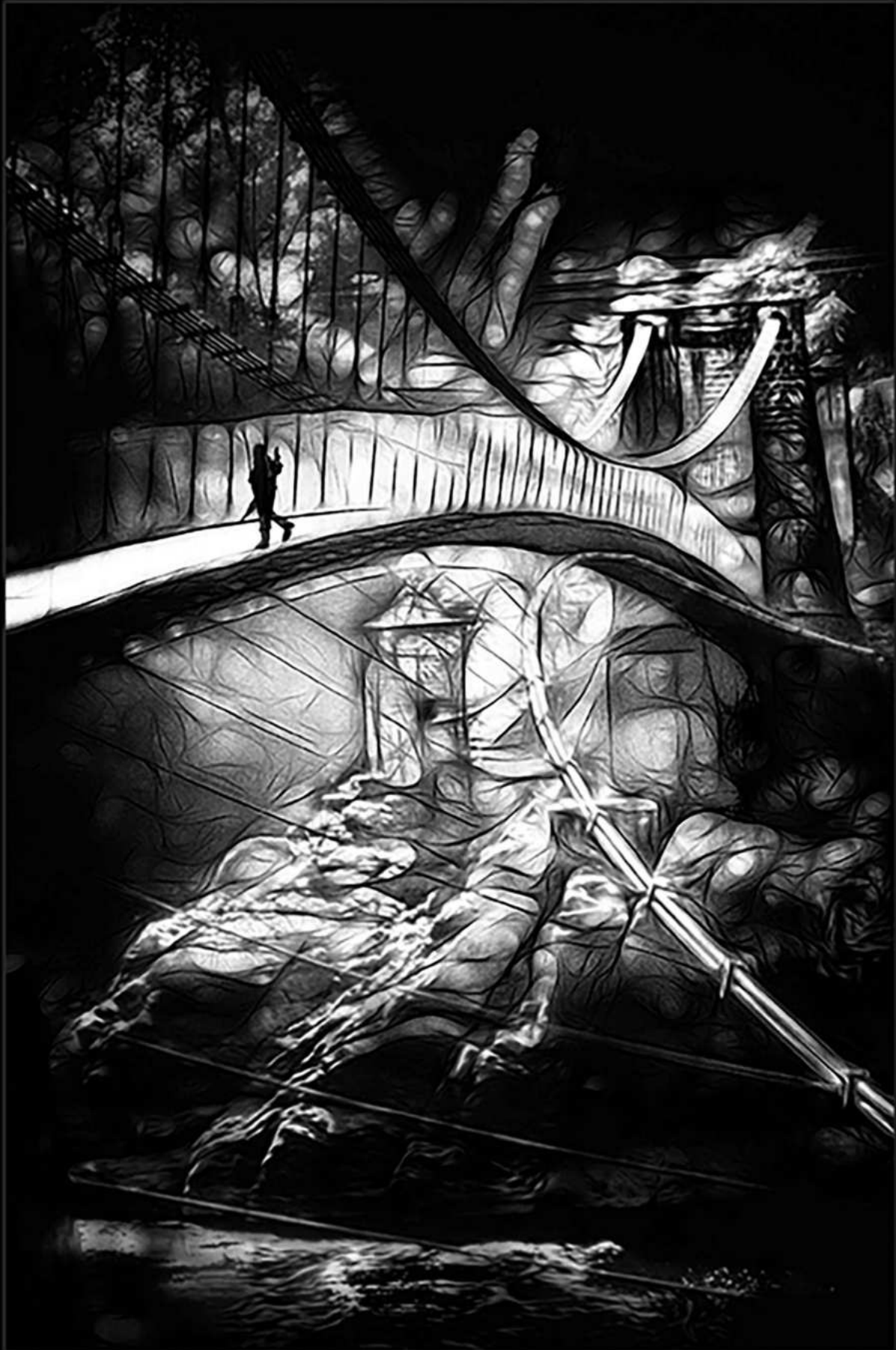
Shunyata: The Ultimate Void: Gangotri