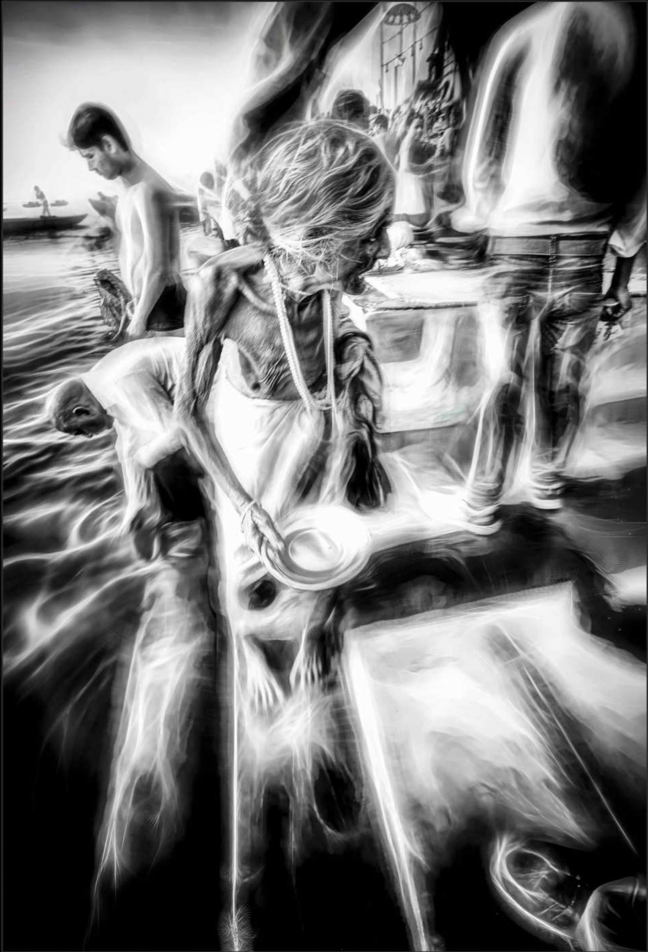
Being Timeless: Varanasi