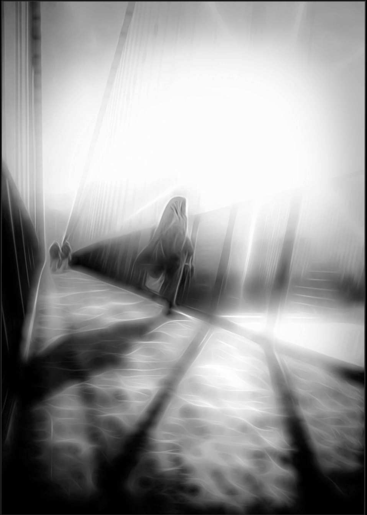
In Search Of The Absolute: Rishikesh