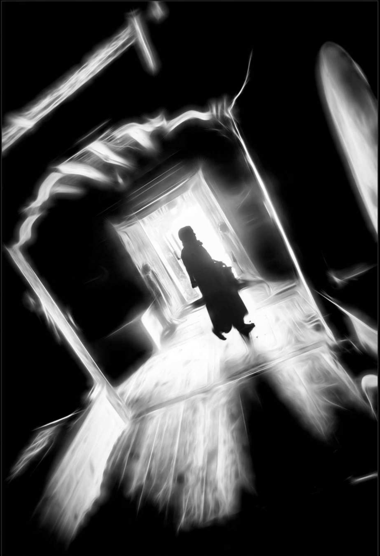
Shunyata: The Ultimate Void: Ladakh